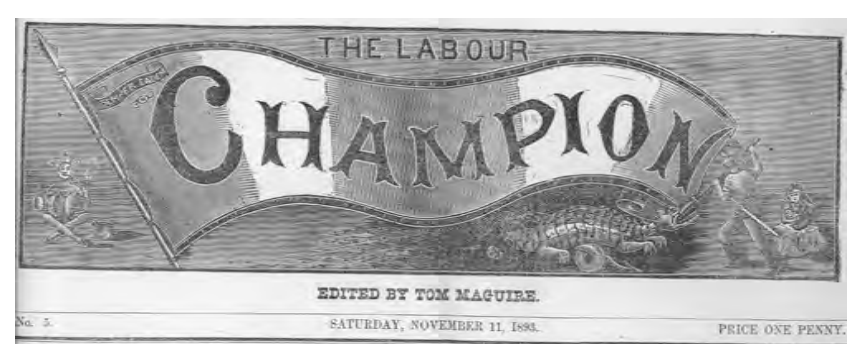
Figure 1: The Labour Champion (1893)

same—suggests the condition of economic and political stasis that the paper militates against. While the mother and child, the fighting worker, and the medieval-esque dragon were utterly standard in socialist iconography of the era, the jester is unusual, and points to Maguire's use of humor, sarcasm, and irony as political tools. An article titled "The Municipal Show," for example, effects the voice of a sideshow barker: "Walk up! Walk up! Ladies and gentlemen. The municipal candidates are about to perform. . . . Be in time, gents, and see the two recently captured Liberal Labour Chameleons—positively their last appearance in public. A prize of one penny is offered to anyone who can tell their true colours." As with the jester in the title design, the implication is that British politics have become so absurd they can only be discussed in the language of fools, clowns, and circuses.