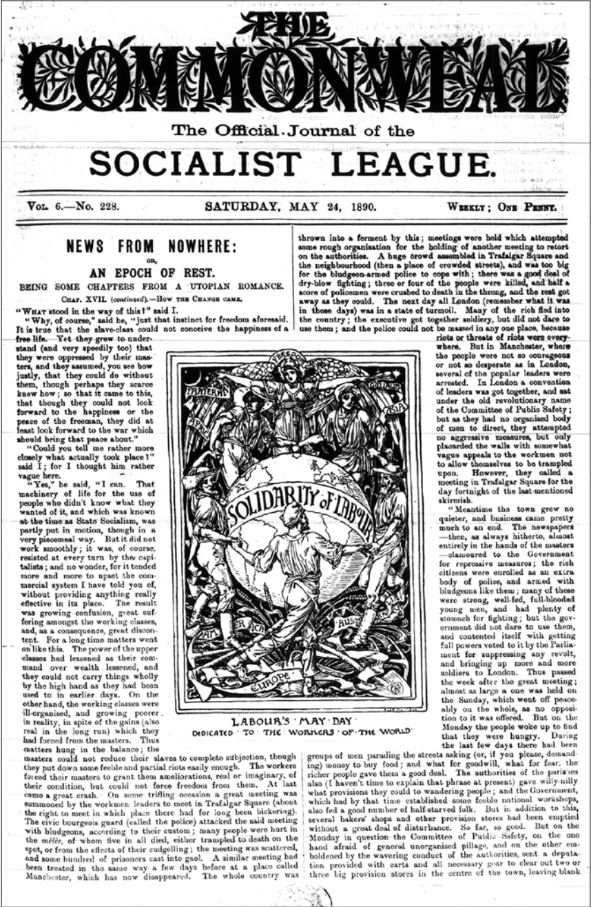
Fig 4 An installment of Morris's novel News from Nowhere in The Commonweal , with a Walter Crane cartoon embedded in the text (May 24, 1890).