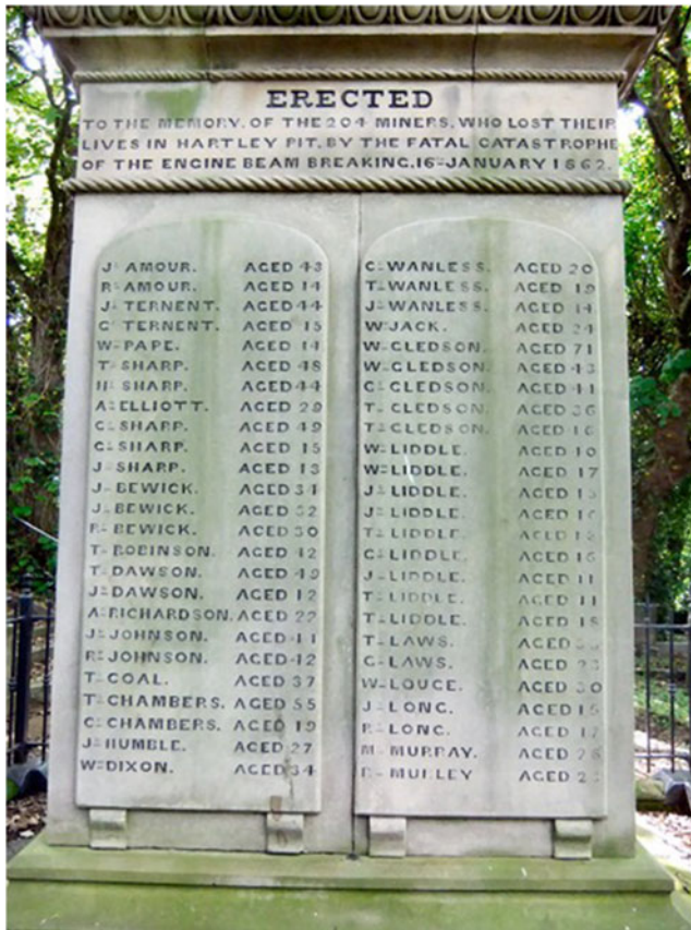
Figure 4. Monument in St Alban’s parish churchyard, Earsdon, Tyne and Wear, to victims of the Hartley Colliery disaster

whom they had adopted.” 61 As the monument to this tragedy records, such events could destroy generations of a mining family—brothers, fathers, sons—in a moment (fig. 4). The death of the child miners in Jane Rutherford could thus be said to anticipate a key feature of Anthropocene temporality, one that Rob Nixon eloquently sums up in the idea of “borrowed time”: “In this interregnum between energy regimes, we are living on borrowed time—borrowed from the past and from the future.” 62 Fossil fuels formed in the deep past, but the residue of their combustion will persist long into the future. Nixon’s sense of a depleted future, of a future from which we are borrowing, shines through in all these novels’ accounts of the social ecology of extraction, just as it shines through in the memorial to the Hartley Colliery disaster with its list of victims from age ten to age seventy-one. Provincial realism shows